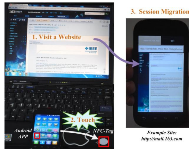
Figure 2. Usage Illustration

We develop a Chrome plug-in and Java-based daemon to realize the desktop side, and deployed it on a laptop (Window OS). We also develop an android application to realize the mobile side, and deployed it on Google Nexus-S (Android OS). The NFC-tag deployed on the laptop encapsulates connection information. The two devices communicate with each other via Wi-Fi.